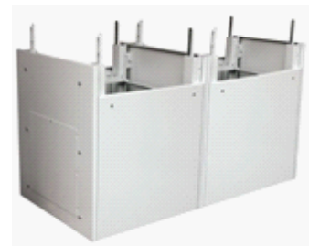
In-ground root double cabinet