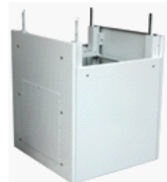
In-ground root single cabinet

The in-ground root is prepared for the installation of a battery tray. When mounting the cabinet the integrated plinth cover can, when removed, provide easy access to cables and other equipment in the root.